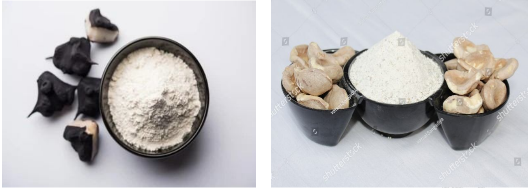
Image 6 and Image 7- Water Chestnut Flour