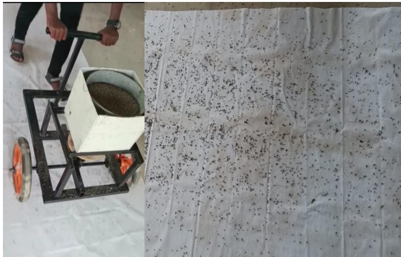
Figure.2 Operation in Laboratory Condition

Where, Ca = Capacity of the applicator in kg/ha, W = Width of the applicator in m, D = diameter of the wheel in m, W_1 = weight of the dropped FYM in both hoppers in kg, and T = time require for 25 revolutions of wheel, hr.