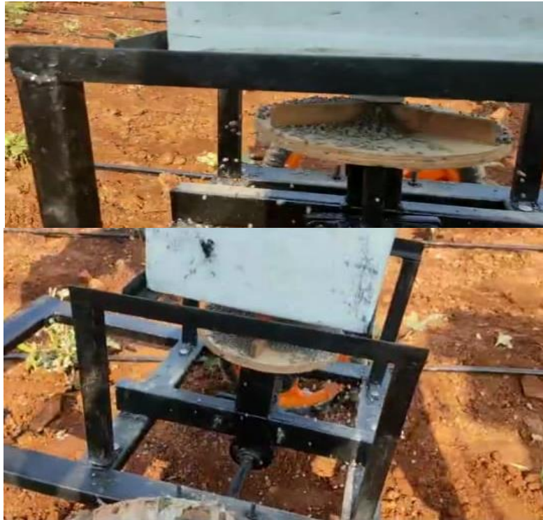
Figure.3 Spinning Disc