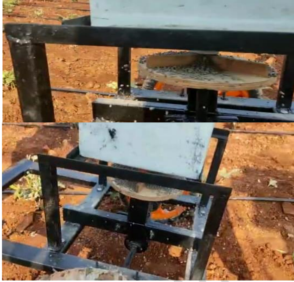
Figure.3 Spinning Disc