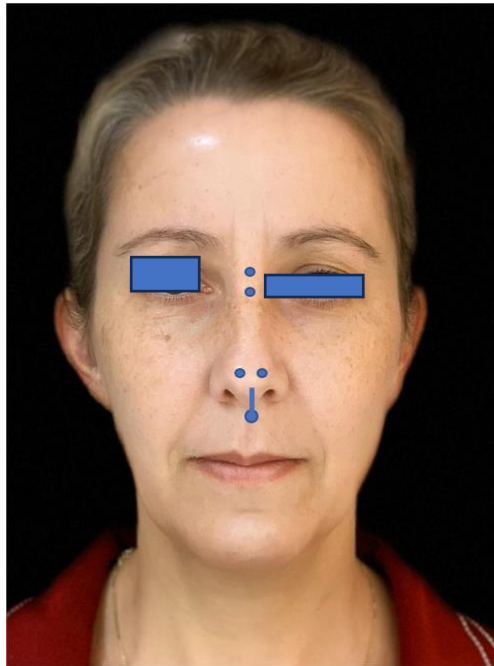
Figure 5- Points that received filling on the nose.

root, in a subcutaneous plane and a retroinjection of 0.1 ml in the columella, totaling a final volume of 0.9 ml, always taking care to aspirate before injecting the filler, in order to avoid any vascular complications (Figure 5).