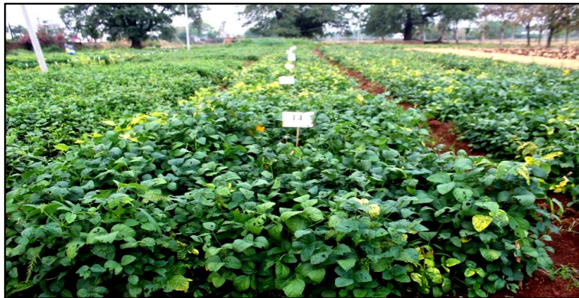
T1 + Foliar spray of flonicamide 50 WG at 0.03% at 20 DAS and 35 DAS