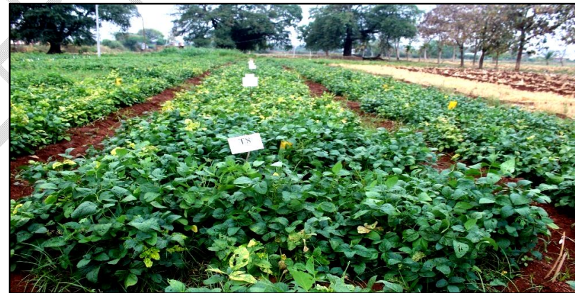
T1 + Foliar spray of afidopyropen 50 g/l DC at 0.2% at 20 DAS and 35 DAS