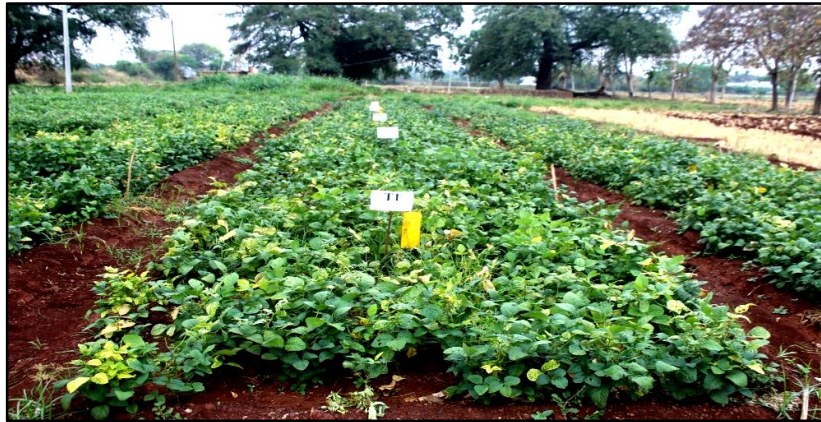
Seed treatment with imidacloprid 600FS at 5ml/kg