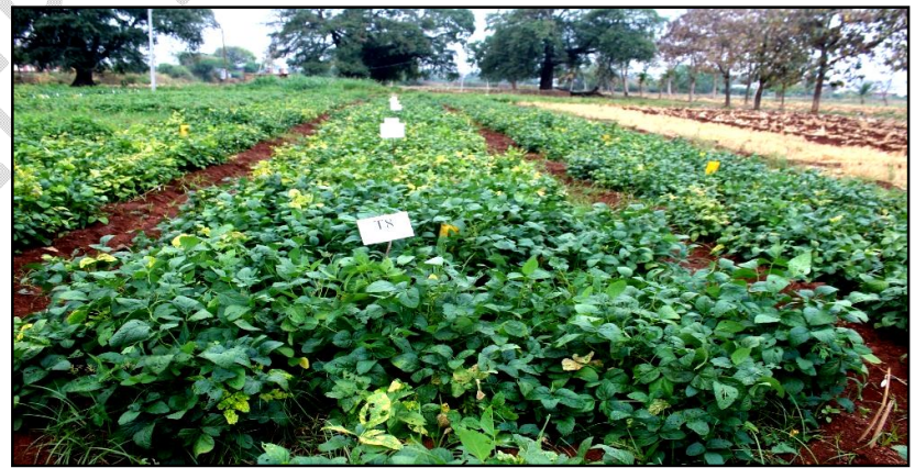
T1 + Foliar spray of afidopyropen 50 g/l DC at 0.2% at 20 DAS and 35 DAS