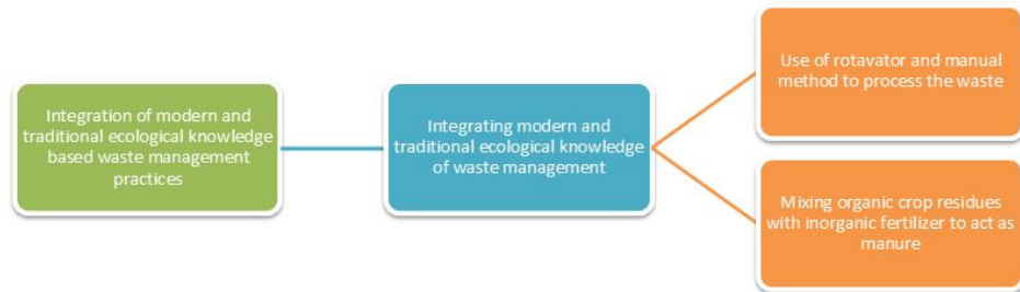
Fig. 4: Theme 2 for Traditional Waste Management Practices; Boxes in Orange represent Codes, those in Blue represent Categories/Sub-themes and that in Green represents the theme.

With the diffusion of better modern technologies and modern practices, the farmers did not completely abandon the traditional methods but rather adopted an integration of both modern and traditional approaches, aiming at hybrid techniques to sustainably and efficiently manage farm waste.