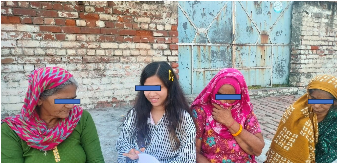
Fig. 2: Interview with farmers at Shimla Maulana in Haryana

Data analysis, a key component of qualitative research, was conducted in accordance with the Thematic Analysis Method developed by Braun and Clarke (2006), which aids in efficiently identifying recurring patterns in qualitative data. The data was analysed in the following manner.