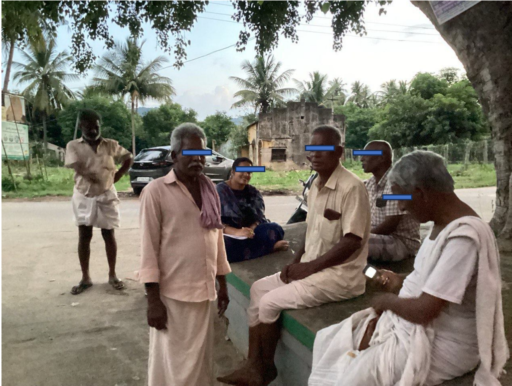
Fig. 1: Interview with farmers at Seetharama Puram in Andhra Pradesh