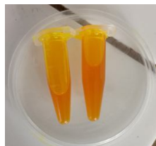
Figure 4: Oil from Curcuma longa (Kouamé, 2024)