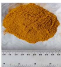
Figure 2: Pulverized Curcuma longa (Kouamé, 2024)