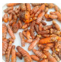
Figure 1: Fresh rhizomes of Curcuma longa (Kouamé, 2024)

Fat content was determined using the method defined by [4]. After extraction with Soxlet for 8 h, the hexane was evaporated using a rotary evaporator. The flask containing the fat was then placed in an oven at 45°C for 24 h to remove any residual hexane. The oil was left to cool in a desiccator for 5 min to avoid wetting the plant material. Finally, the flask containing the fat (P2) was weighed. This oil is shown in figure 4.