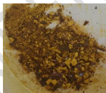
Figure 3: Hydroethanol extract of Curcuma longa (Kouamé, 2024)