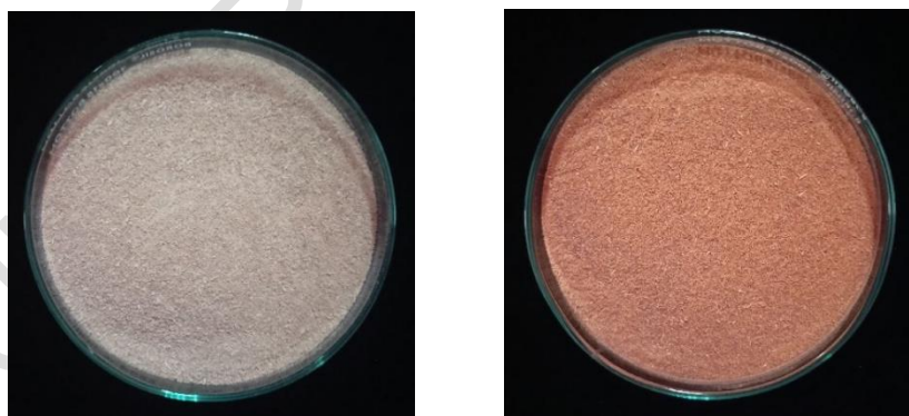
Plate 1. Colour enhancement of Coconut inflorescence powder

Control v/s CIP prepared by boiling in water (95-100°C) for 30 minutes and drying in cabinet dryer at 60°C (C2D1)