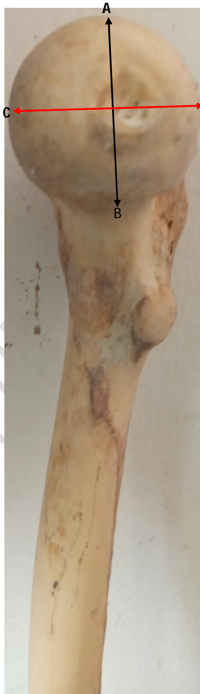
Fig 2: Left Femur (©rsa2024) Fig 3: Head of the femur- (©rsa2024)

A-B is Supero-inferior (vertical) diameter C-D is Medio-lateral (horizontal) diameter.