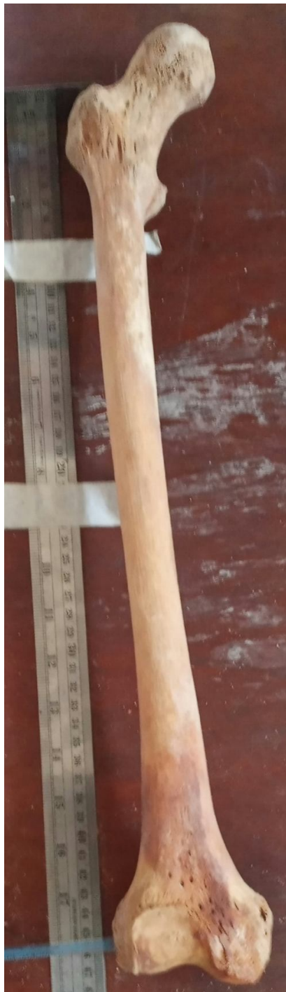
Fig 1: Measurement of the length of the femur (Right).