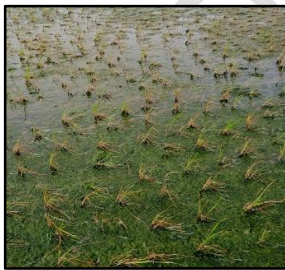
3a. Kresek phase