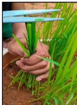
disease incidence across twelve