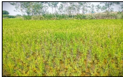
Figure 2. Blighted appearance of the field infected with BLB

Adhikari et al. (1994) found a strong correlation between the progression of bacterial leaf blight and environmental factors like rainfall and relative humidity. Additionally, Kapoor et al. (2004) equally suggested significant variations in rainfall and its distribution within growing seasons from 1979 to 1999. Understanding these parameters is crucial for effective disease management.