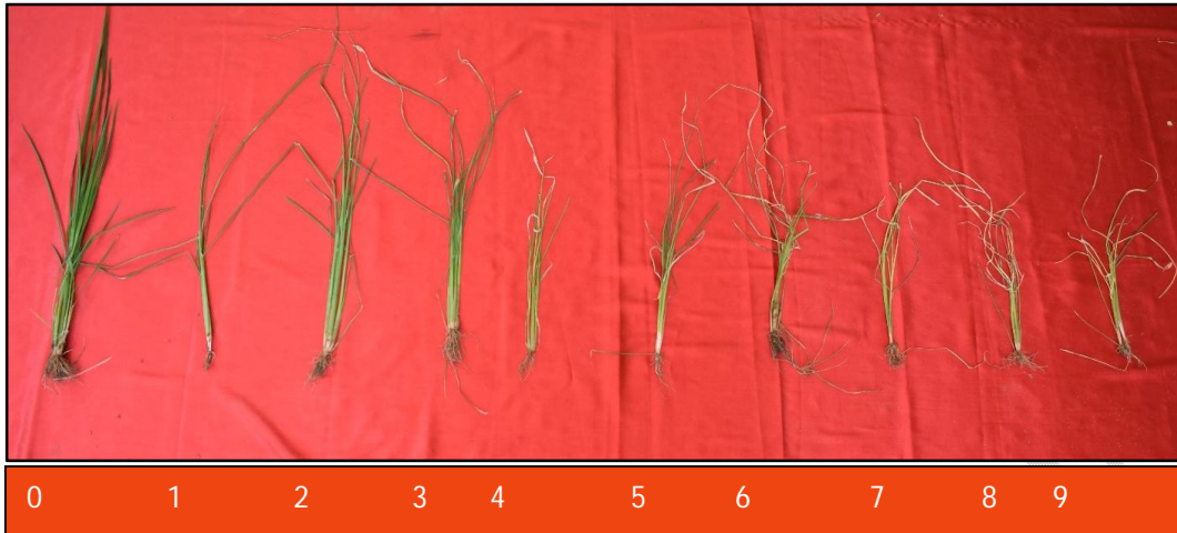
Figure 6. Rice bacterial blight disease scoring on 0–9 scale based on lesion length on the clip inoculated leaves.