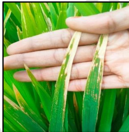
3b. yellowish stripes at the margins