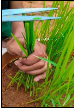
Figure 4. Leaf inoculation of bacteria by leaf clipping method for pathogenicity test