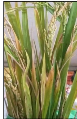
3c. straw yellow wavy margins