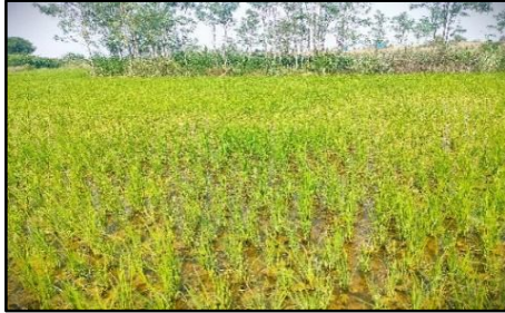
Figure 2. Blighted appearance of the field infected with BLB

Adhikari et al. (1994) found a strong correlation between the progression of bacterial leaf blight and environmental factors like rainfall and relative humidity. Additionally, Kapoor et al. (2004) equally suggested significant variations in rainfall and its distribution within growing seasons from 1979 to 1999. Understanding these parameters is crucial for effective disease management.