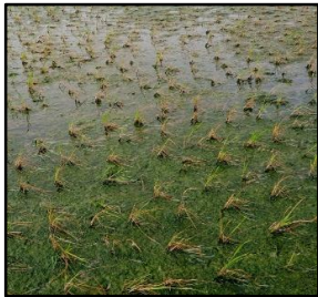
3a. Kresak phase