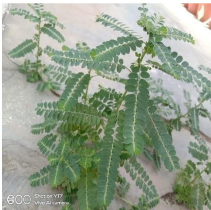
Figure 1: Phyllanthus niruri