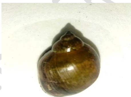
Figure 2: Lymnaea acuminata