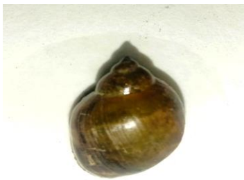
Figure 2: Lymnaea acuminata