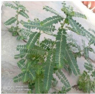
Figure 1: Phyllanthus niruri