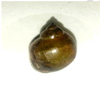
Figure 2: Lymnaea acuminata

Commented [MOU6]: Cite these figures in a paragraph