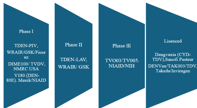
Fig 1. Current dengue vaccines