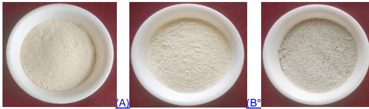
(A) Brown color horse gram flour (B) Cream color horse gram flour (C) Black color horse gram flour