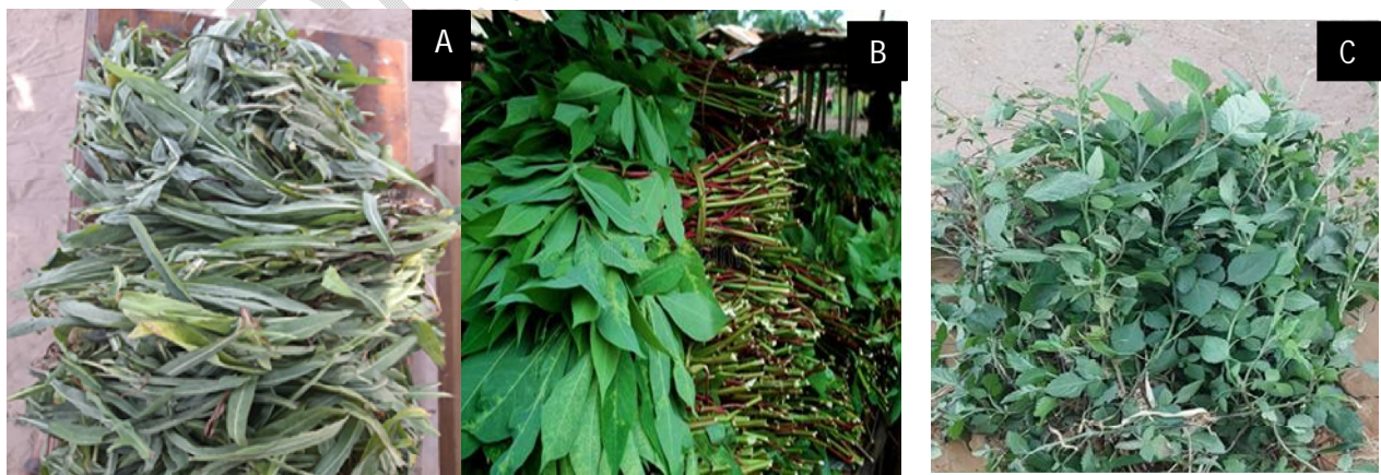
Figure 2: Pictures of the three vegetables taken from the selected farms (A: Bitter lettuce, B: Cassava leaves, C: Black jack)

Three indigenous vegetables (black jack leaves, cassava leaves and bitter lettuce leaves) that are commonly consumed in Mkuranga District were used in this study. Vegetable samples were purposively selected due to their availability and accessibility during the study period. A total of 4 kg of each vegetable sample was collected from two production areas in each ward (Mkamba and Kisegeze) with the help of the natives. Vegetable samples were harvested, cleaned to remove dust, and put in sealed plastic bags. The samples were then placed in a cool box and transported to the laboratory at Sokoine University of Agriculture, where they were stored at 4°C for one day before further processing and laboratory analysis.