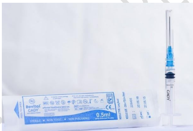
Figure 1. AD 0.5ml Syringe

The focus of this comprehensive overview is on the evaluation of the performance of AD 0.5 ml syringes, an integral component of medical interventions. As the medical device landscape evolves, regulatory bodies such as the European Medical Device Regulation (EUMDR), the International Organization for Standardization (ISO) with its stringent ISO 13485 standard, the United States Food and Drug Administration (USFDA), and the Medical Device Single Audit Program (MDSAP) continually refine and update guidelines to address emerging challenges and enhance patient safety. The below given figure 1. demonstrate the AD 0.5ml Syringe.