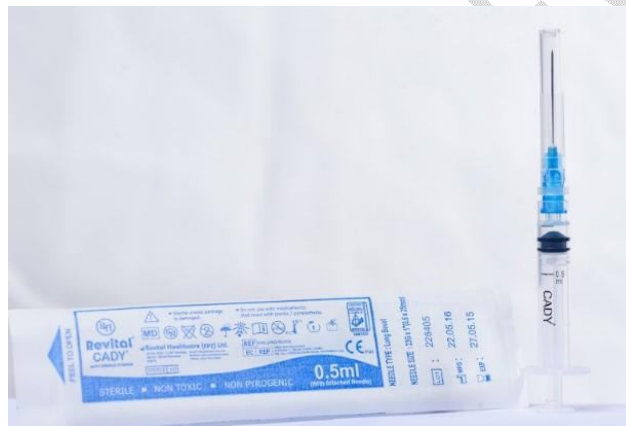
Figure 1. AD 0.5ml Syringe

The focus of this comprehensive overview is on the evaluation of the performance of AD 0.5 ml syringes, an integral component of medical interventions. As the medical device landscape evolves, regulatory bodies such as the European Medical Device Regulation (EUMDR), the International Organization for Standardization (ISO) with its stringent ISO 13485 standard, the United States Food and Drug Administration (USFDA), and the Medical Device Single Audit Program (MDSAP) continually refine and update guidelines to address emerging challenges and enhance patient safety. The below given figure 1. demonstrate the AD 0.5ml Syringe.