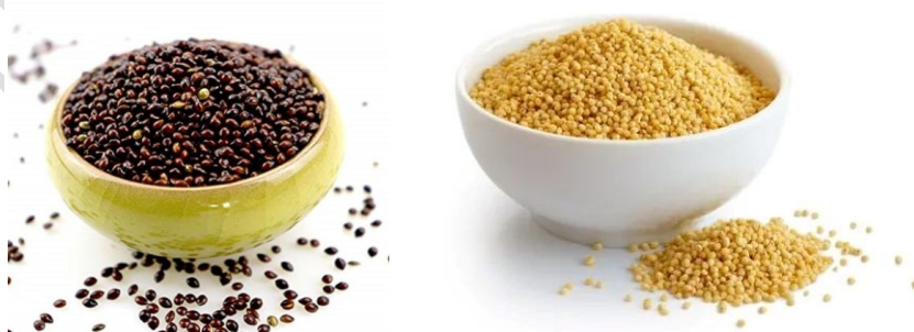
Fig: 2. Black and orange color seed in foxtail millet.

Foxtail millet ( S. italica L.) is a significantly used both for food and fodder and it is cultivated in semiarid, dry, temperate, warm regions of Africa and Asia [17]. Morphologically foxtail millet is a few tiller and single stack plant. Plant height reaches up to 120–200 cm [19]. A single inflorescence can produce hundreds of small convex seeds measuring about 2 mm in diameter, encased in a thin, papery hull [10]. A Full matured plant of foxtail millet has a thin, leaf stems, silky, hairless leaves. The leaves are smooth and hairless, arc-broad and the culms are erect, slender with hollow internodes. The stems are topped by a bristly panicle which is 5–30 cm long and mostly reddish or purplish [19]. The seed head is 5–30 cm long, thick, hairy panicle, seed color may vary amongst genotypes and variety, The color of the seeds varies greatly between varieties, that can be red, brown, black and also pale yellow colour [10, 15]. The non-dormant seeds germinate readily in a glass house at densities up to 100 plants per square meter or in field conditions in temperate or tropical regions [10].