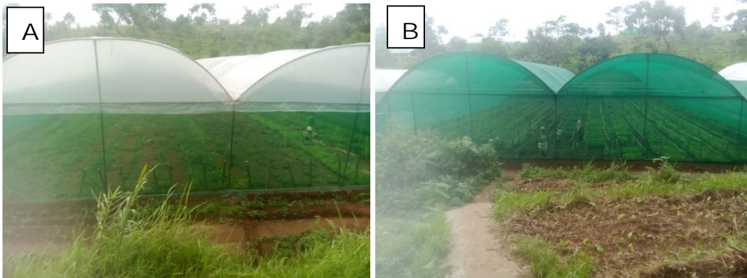
Fig 1: (A) Model 1 and (B) Model 2. Kyrwen Nurseries, Meghalaya India.

This method was adopted in two types of agro-shade net nurseries (Fig 1), both using a green net with a 50% shade factor. The first type (Model 1) is a poly-cum-shade net house covered with translucent 200 \mu UVS plastic on top, and sides are covered with 50% green shade net. The second type (Model 2) is completely covered with 50% shade net.