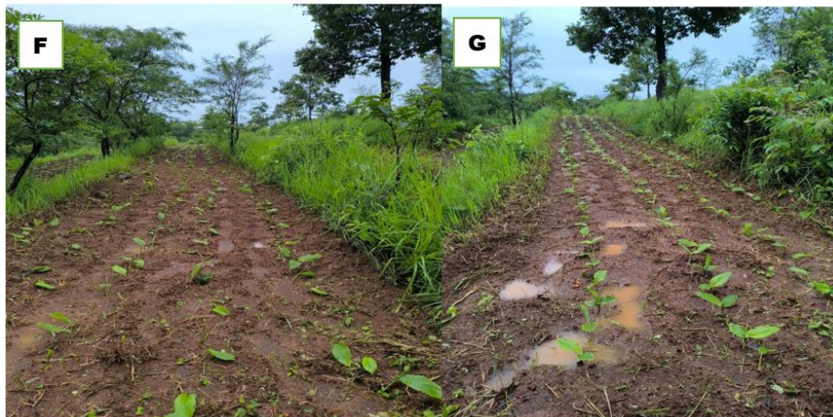
Figure 3: (F) Seedlings transplanted directly from the media and (G) transplanted from the plugtray

Seedling of Lakadong from the medium shows very low life expectancy when transplanted to the field, whereas seedlings from the plugtrays showed better performance (Fig 3). Research suggests that the use of plug trays can reduce seedling mortality and can produce a greater number of viable seedlings in the field [15;16] . Turmeric plants recorded highest plant height, number of leaves and number of tillers through single node rhizome raised in plugtray for one month and then transplanted in the field, compare to single node rhizome transplanted directly in the field [17] .