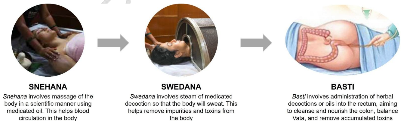
Figure 1. Graphical representation of Ischemia Reversal Program (IRP)