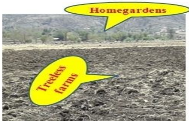
Figure 3. Photo showing HAF and MCS

In each HAF and mono-crop field one 10m*10m (100m 2 ) sample plot was purposefully laid at the center of each of the farms for soil sampling. Soil was sampled in January 2018 after annual crops harvest. The thirty plots, 15 for HAF and 15 for MCS, were considered for soil sampling. In each plot, five soil pits (from four corners and at the center), following the recommendation of [43] and [44] were dug in an 'X' design. From each pit, soil samples from a depth of 0-30 cm were collected and mixed in a large bucket to form one composite soil sample representing the plot. A total of 30 composite soil samples were taken for analysis of N, P, K, SOC%, EC, CEC and soil pH. In one of the five pits [45], an undisturbed soil samples using core sampler of height 5cm and diameter of 5cm (5cm*5cm) were collected for BD determination and there by SOC stock. Hence, for this purpose, a total of 30 disturbed soil samples and 30 core samples were taken. The core samples were oven dried at 105°C for 24 hours [46]. The disturbed soil samples were also air dried, grounded and passed through a 2 mm sieve prior to analysis.