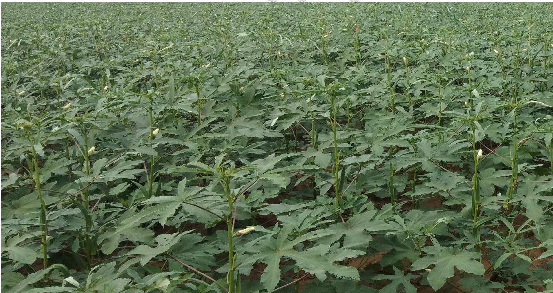
Fig.3: Field view of the Anand Komal