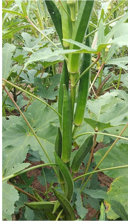
Fig. 2: Short internode and fruiting characteristics of the Anand Komal