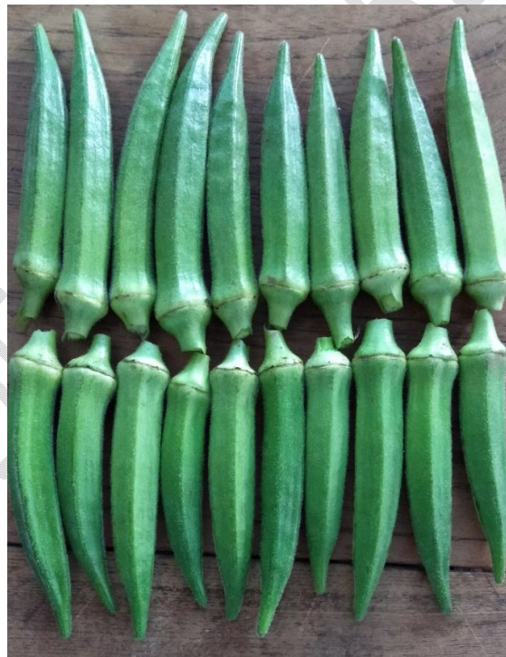
Fig. 1: Narrow acute shape of apex and dark green fruit colour