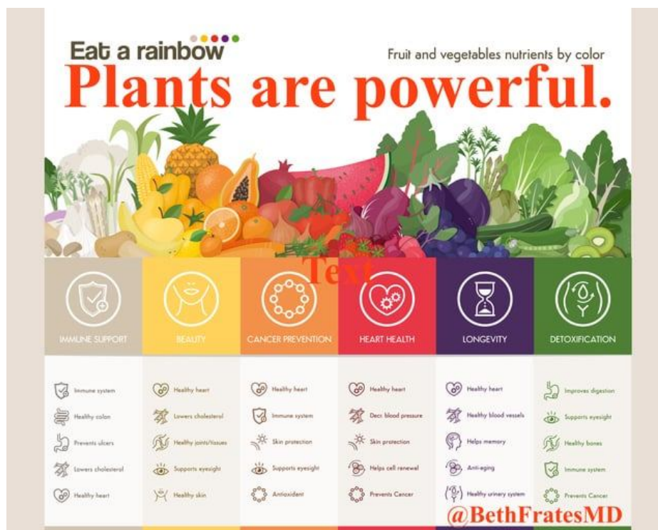
Figure 2: Colourful Vegetable Plate