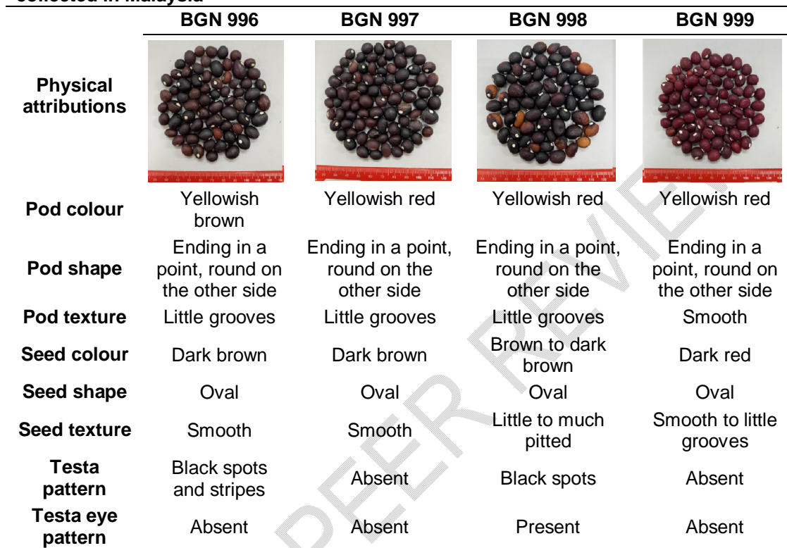
Table 1. Morphological characteristics of BGN 996, BGN 997, BGN 998 and BGN 999 collected in Malaysia

mesh size. The samples were then kept in the chiller at -80°C until needed for further analysis.