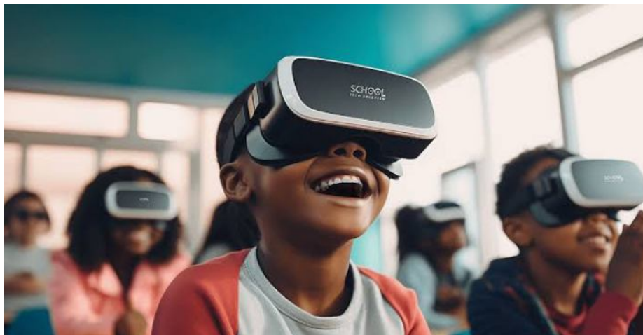
Figure 2: An illustration of AR intervention in a typical classroom (School Tech Solution, 2024)

glasses, Holographic AR Display and ARCore were deployed for the study. Students were made to be familiarised with the devices and group work where students create AR models was encouraged. Figure 2 shows an illustration of AR intervention in a typical classroom.