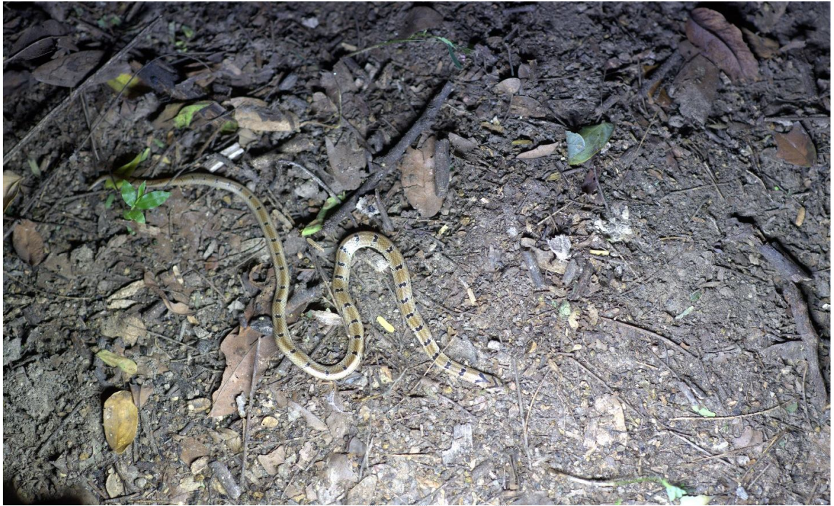
Fig 2: A typically coloured Common Kukri Snake ( Oligodonarnensis ).