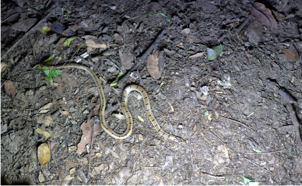
Fig 2: A typically coloured Common Kukri Snake ( Oligodonarnensis ).