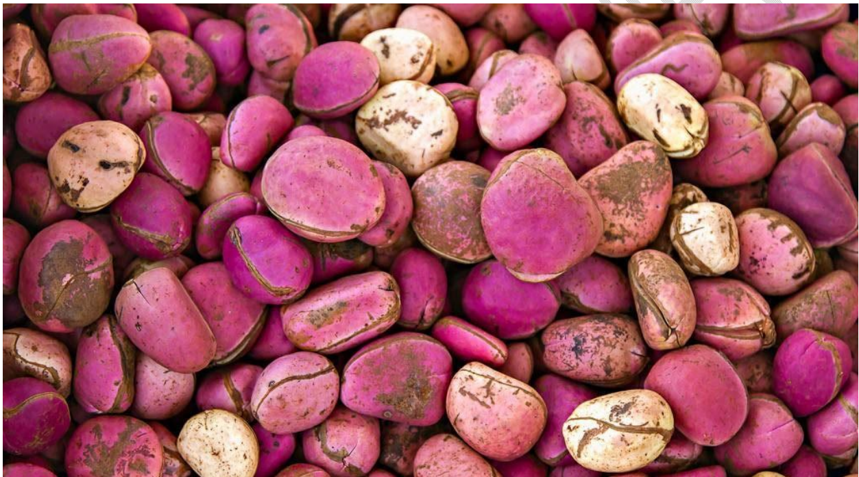
Figure 1 showing the Cola nitida ( Available )

important building blocks for the creation of several medications and are found in large quantities in the Cola nitida's seed, pod, and seed shell. However, a lot of its potential is still unrealized. Previous research has demonstrated the health benefits of Cola nitida [11]. It may have anticarcinogenic, antioxidant, antibacterial, and antidiabetic effects in addition to its capacity to prevent pituitary cells from releasing luteinizing hormones (LH), which may indicate that it has a function in reproductive regulation [12]. This study aims to explore the possible health advantages of the phytochemicals found in Cola nitida , specifically their potential as a cancer treatment intervention.