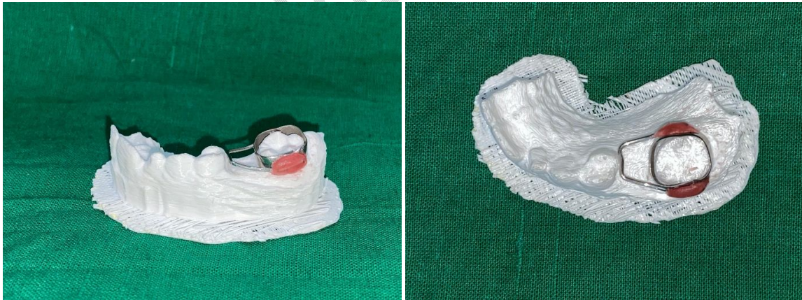
Figure – 4 Fabrication of Conventional Band and loop space maintainer