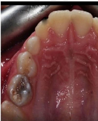
Figure – 1 Intraoral View showing grossly decayed 55

A 9 years old female patient reported to the OPD of Department of Paediatric and Preventive Dentistry complaining of decayed tooth in upper left back tooth region in the last 25 days. Upon examining the patient, it is observed that there is a pulp necrosis wrt 55 [Figure-1]. IOPA was done wrt 55 which showed premolar at Nolla's stage 4. Treatment plan was decided to Extract 55 and to give space maintainer to maintain the space for the eruption of 15. The Extraction done wrt 55 under local anaesthesia. When socket healed properly the arch was scanned using an intra oral scanner (iTero Element Flex intraoral scanner). After scanning STL file of a scan is formed [Figure-2] and the file is transferred to 3d Printer (ELEGOO Neptune 4 plus FDM 3D Printer) [Figure-3]. After Formation of the 3D model, conventional band and loop space maintainer is formed on the received 3D model [Figure- 4]. The Band and loop Space maintainer was tried clinically with respect to upper Right deciduous second molar and after adapted Properly to the tooth, glass ionomer cement was used to cement it on the tooth surface (Type 2, GC Gole label). The Patient was instructed not to drink water and not to chew tightly for 30 minutes. And recalled after 3 months.