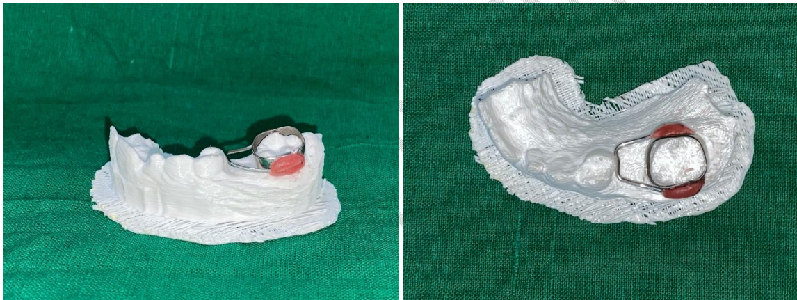
Figure – 4 Fabrication of Conventional Band and loop space maintainer