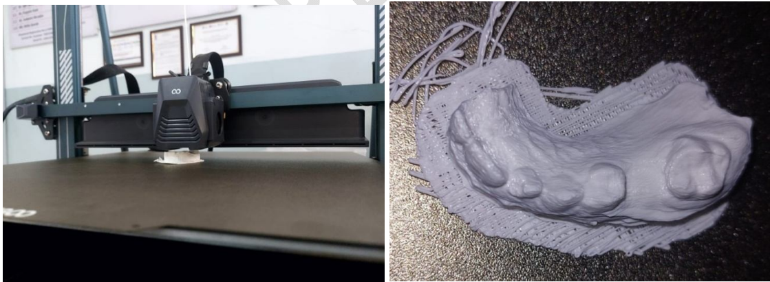
Figure – 3 ELEGOO Neptune 4 plus FDM 3D Printer and 3D model