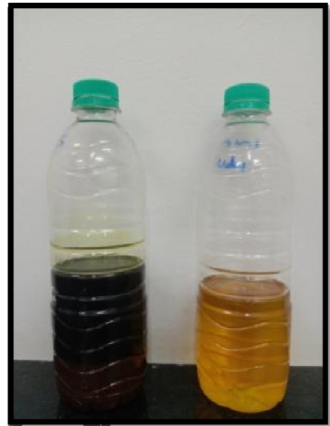
Oil and Biodiesel