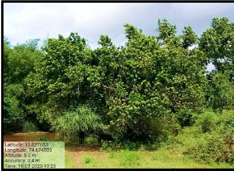
Gantihole - Udupi