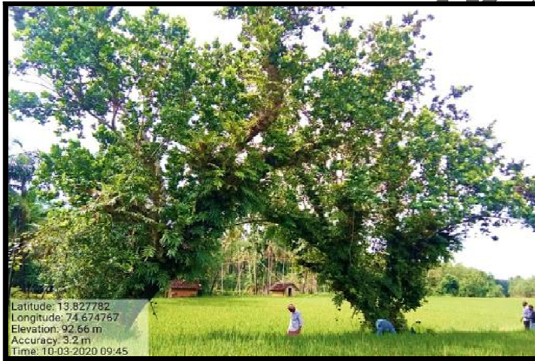
Kapsi - Udupi