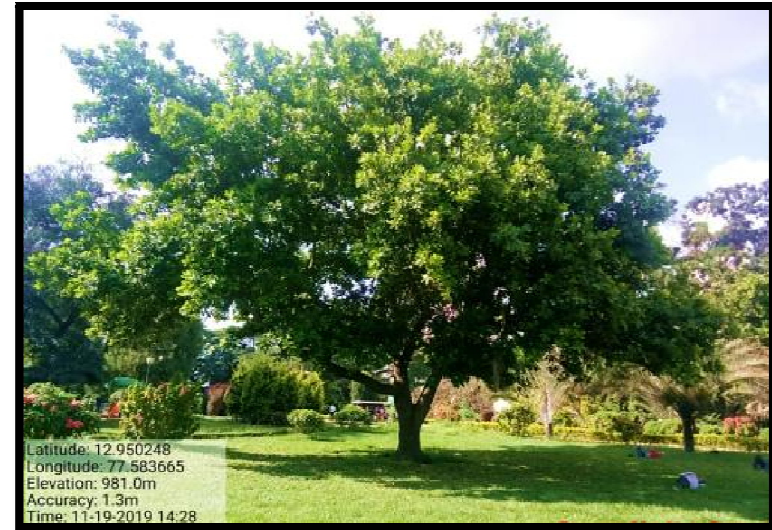
Lalbagh 2 - Bangalore