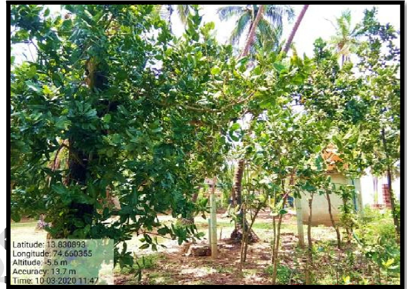
Dombi - Udupi