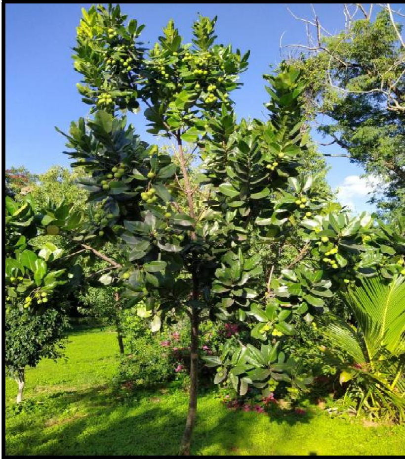
GKVK 1 - Bangalore