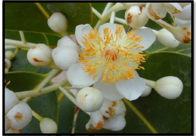
Fragrant White Flowers