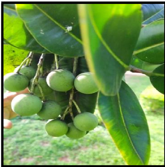
Fresh fruits in tree