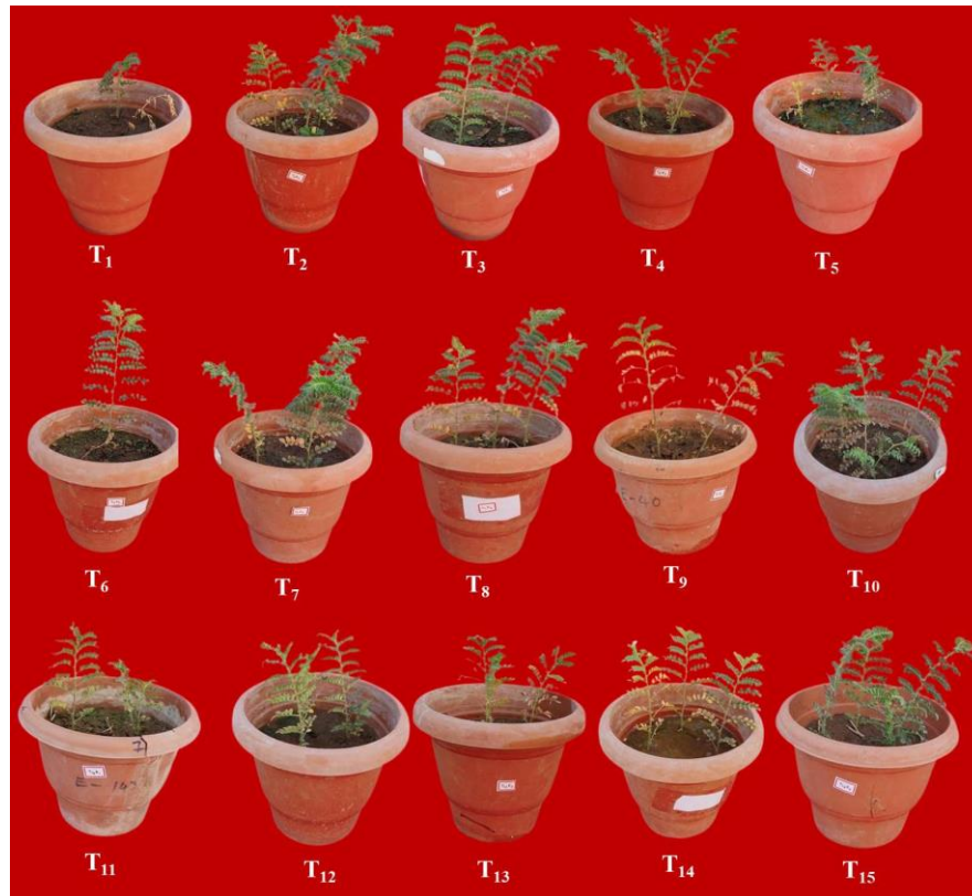
Figure 3. Management of Collar rot of chickpea under pot culture

In the present study, tebuconazole based treatments like soil application and seed treatment alone and incorporation with other treatments found effective in reduction of S. rolf sii infection on chickpea at the time germination (0.00%), but found less effective in reducing the collar rot incidence after 30 days (44.44%) and 45 days (55.55%) after sowing. Our results were similar to the findings of Gour and Sharma (2010), who studied the effect of fungicides on groundnut root rot caused by S. rolf sii and reported that application of Folicur 250 EW (tebuconazole) showed zero per cent PDI at 3 DAS and 16.4 per cent PDI at 30 DAS on groundnut.