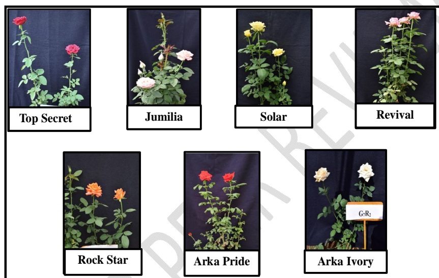
Plate 1. Varieties evaluated for the experiment

polyhouse is made up of galvanized iron pipe and UV stabilized polythene film of 800 gauge as cladding material. By operating the foggers and side rollable flaps, the temperature and humidity were maintained. All the recommended practices and special horticultural practices were followed. Different plant protection chemicals were applied against different pests and diseases. Five plants were randomly selected from each replication for carrying out performance studies. The data on various growth, flowering at 120 DAP and yield parameters were recorded (November 2022 – September 2023) and statistically analysed (Panse and Sukhatme, 1985).