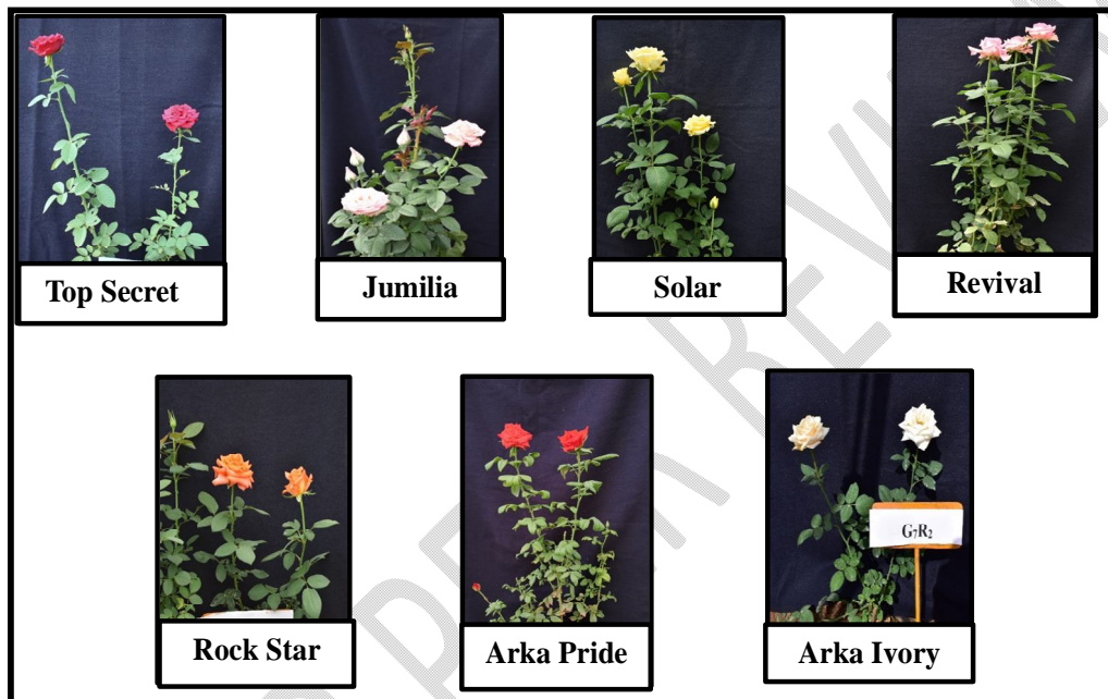
Plate 1. Varieties evaluated for the experiment

polyhouse is made up of galvanized iron pipe and UV stabilized polythene film of 800 gauge as cladding material. By operating the foggers and side rollable flaps, the temperature and humidity were maintained. All the recommended practices and special horticultural practices were followed. Different plant protection chemicals were applied against different pests and diseases. Five plants were randomly selected from each replication for carrying out performance studies. The data on various growth, flowering at 120 DAP and yield parameters were recorded (November 2022 – September 2023) and statistically analysed (Panse and Sukhatme, 1985).