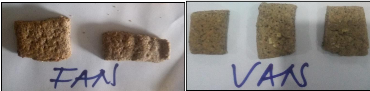
Fig. 1e: wheat:fermented cowpea hull – 80:20 Fig. 1f: wheat:fermented cowpea hull – 75:25