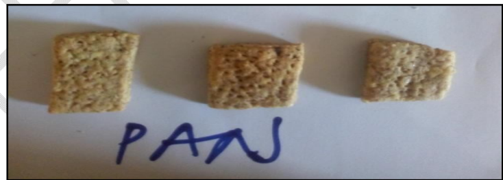
Fig. 1a: wheat:fermented cowpea hull – 100:0