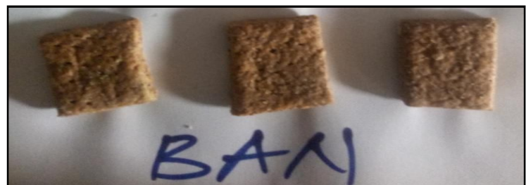
Fig.1c: wheat:fermented cowpea hull – 85:15