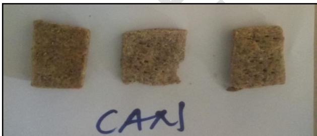
wheat:fermented cowpea hull – 90:10