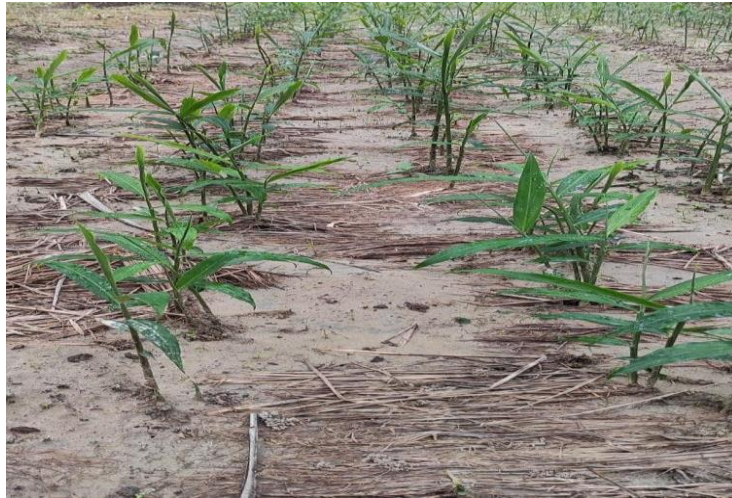
Plate 1: General view of experimental plots.