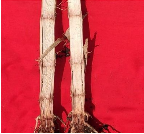
Fig 2. Symptoms of major seed borne fungal diseases in maize