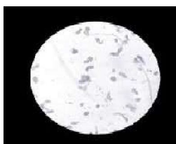
Plate 1. Microscopic view of

The periphery of the colony was olive-green, with a black centre and dull white spots. The growth of the fungus was smooth. The conidiophores were short, arising singly. In shape, the conidia were obclavate but few were oval or pyriform with a rather short, broadly rounded base with 3-8 transverse septa and several longitudinal septa with variable size and shape.