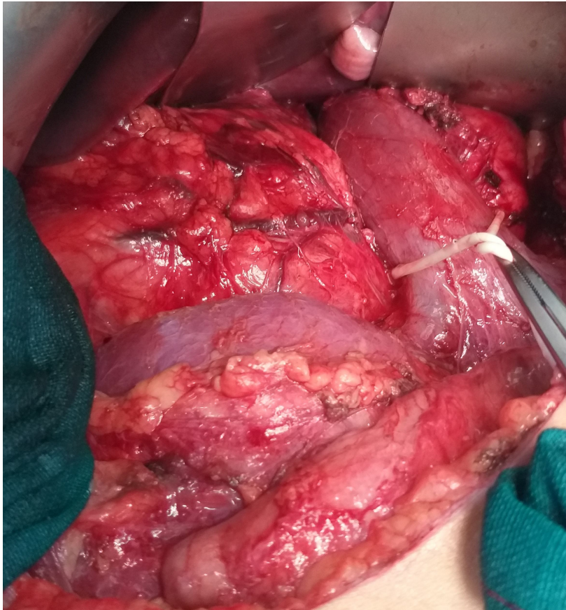
Figure 2: Intraoperative view showing the vascular relationships where the mass is compressing the inferior vena cava and the right renal vein.