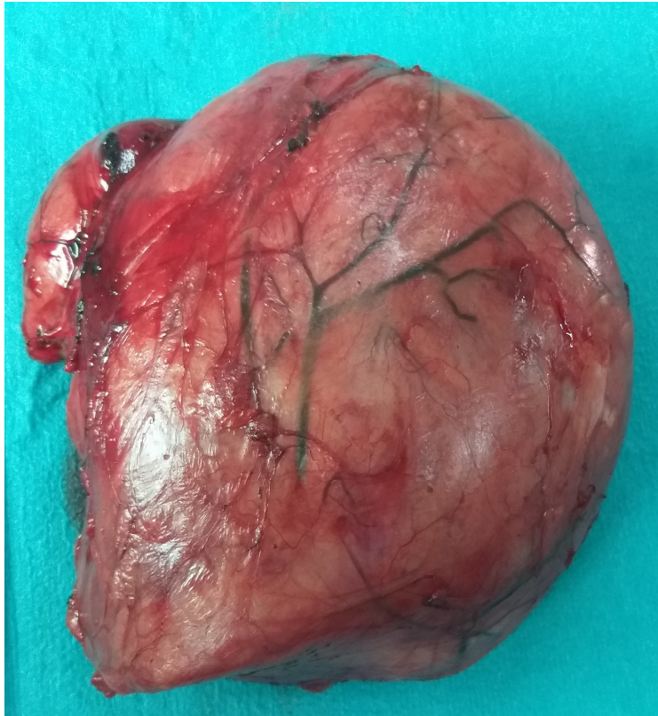
Figure 3: Surgical specimen.