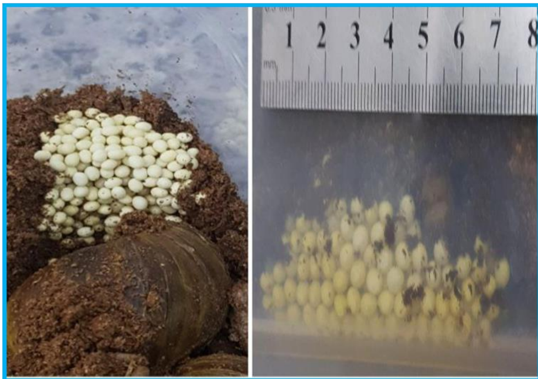
Figure (1) The quantity and number of eggs in a mother shell hole 14.4 cm

Figure (1) It shows how eggs are laid in clusters or batches, often closely grouped together. This assembly helps protect the eggs and may provide some level of insulation or moisture retention,