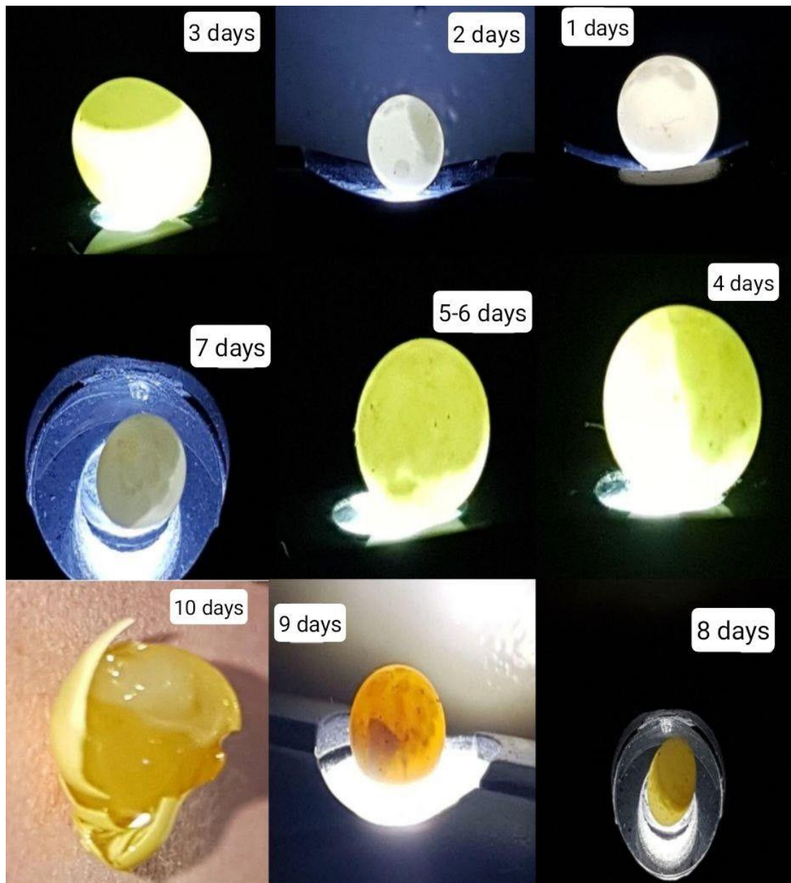
Figure (3) Stages of embryonic development of Achatina fulica

young conch are not very clear, but after a few days the features appear and become defined in their shapes .