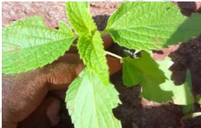
Figure 4. Leaf damaged by chewing insects