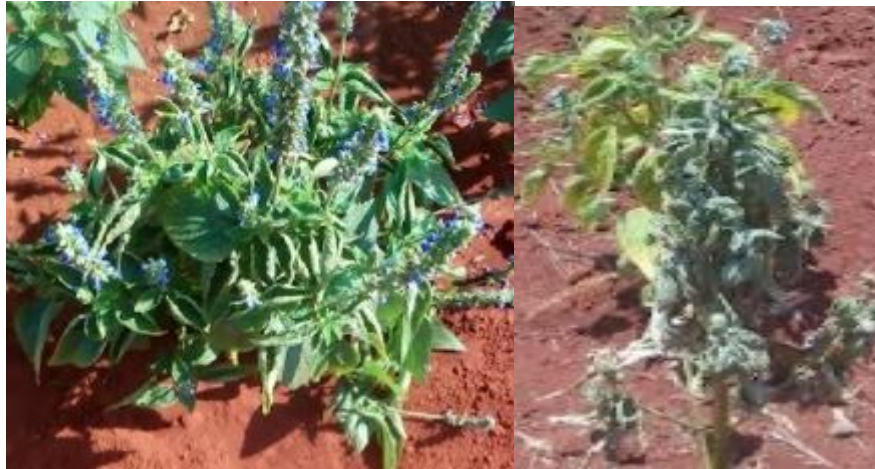
Figure 5. Viral symptoms: leaf curling, chlorosis, wilting

a risk to Chia's production since the presence of pests such as Bemisiatabaciis present in many agricultural farms in Kenya. With new viral infections in Kenyan farms, there is a need for more research on the causes and the influences of viral diseases on the growth and yield of Chia.