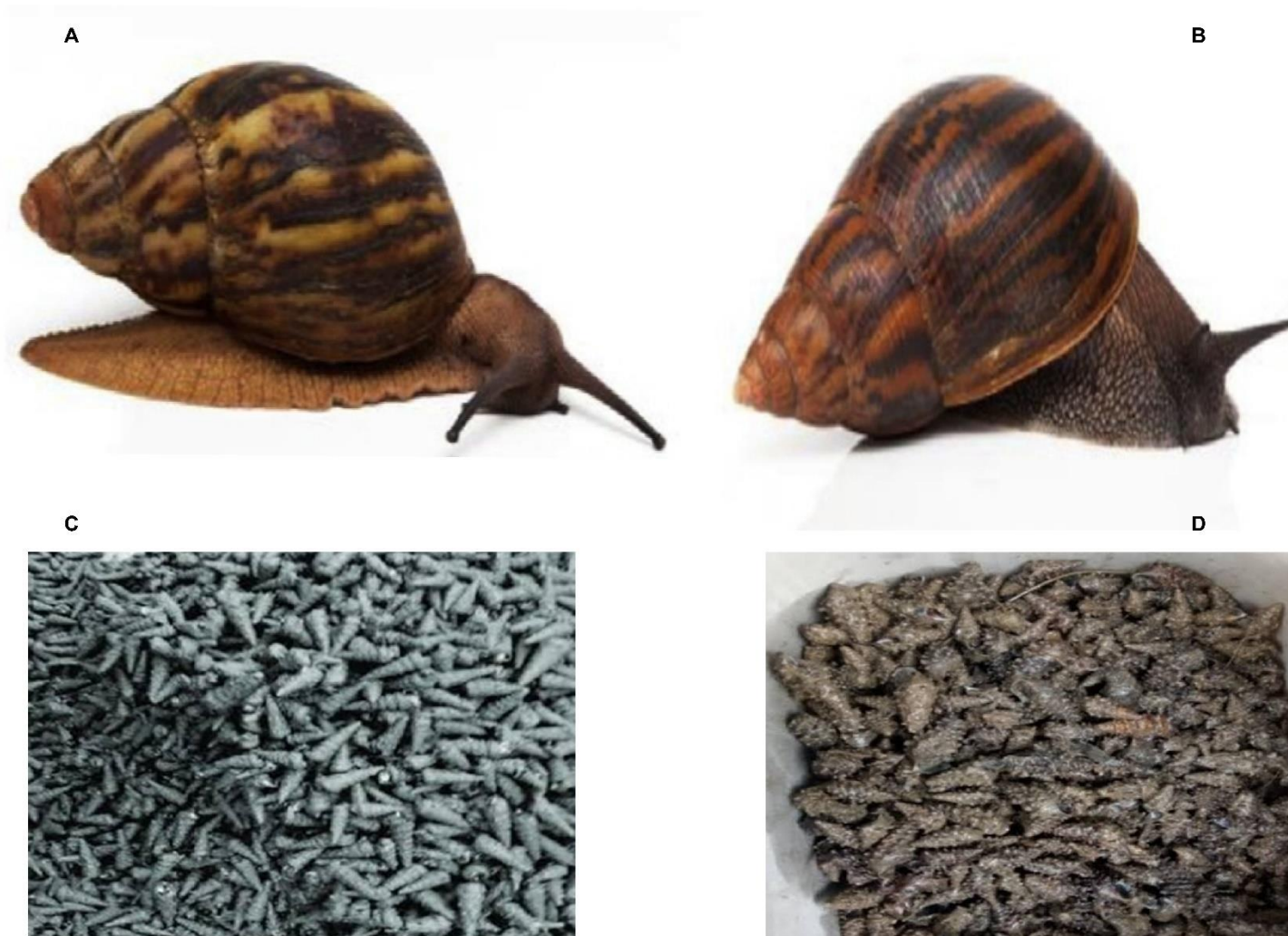
Figure 1. Diagram of Gastropods species used in the study. A. Archachatina marginata , B. Achatina achatina , C. Tympanotanus fuscatus and D. Pachymelania aurita