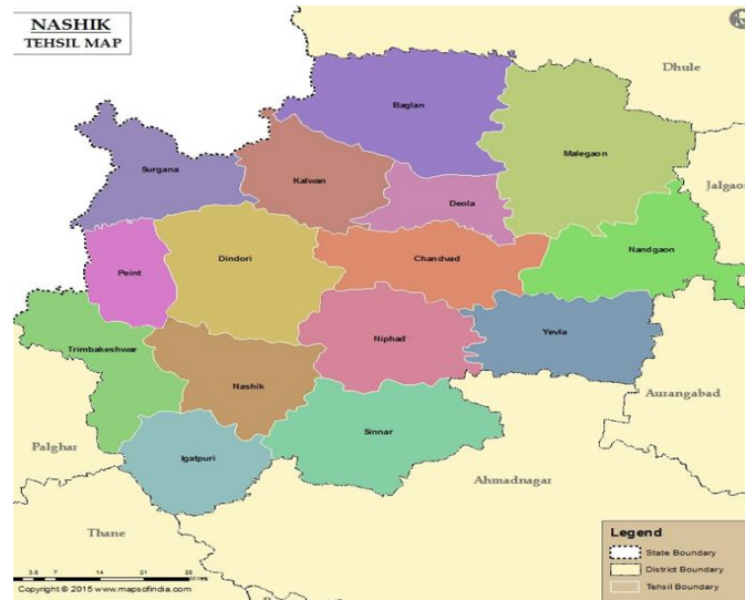
Fig .1 Study area