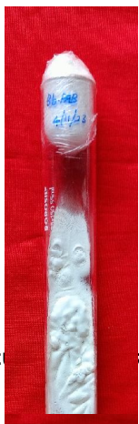
Fig. 1. Slant culture of B. bassiana

For preparation of oil cultures, 4 oils were chosen viz., 2 vegetable oils (Rice bran oil, Sesamum oil) and 2 mineral oils (Heavy grade Mineral oil, Liquid paraffin oil). Sabouraud's Dextrose Agar with Yeast Extract Medium (SDAY) was prepared, poured into test tubes, autoclaved at 121°C at 15 Psi for 15 minutes and made as slants. After slants got cooled down, discs or loop of spores and mycelia of laboratory-maintained culture of B.bassiana were inoculated into slants under aseptic condition and incubated at 25 ± 2°C temperature. Ten to twelve days after inoculation, satisfactory growth and sporulation of B.bassiana were obtained in almost all slants (Fig. 1). Each fungal slant was poured with autoclaved vegetable and mineral oils viz., Rice bran oil, Sesamum oil, Mineral oil and Liquid paraffin oil respectively until the entire fungi grown in slant media got submerged with oil (Fig. 2).