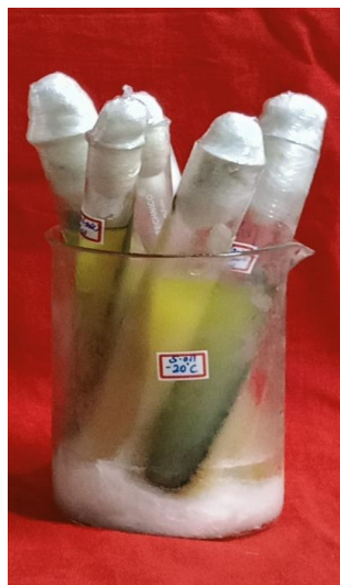
Fig. 2. B. bassiana oil cultures

Humber (2012) reported that storage of culture slants under a layer of sterile mineral oil was one of the oldest, simplest, and least expensive methods for long-term culture preservation.