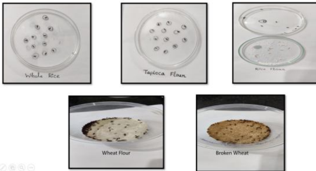
Fig 2. Red flour beetles from different hosts