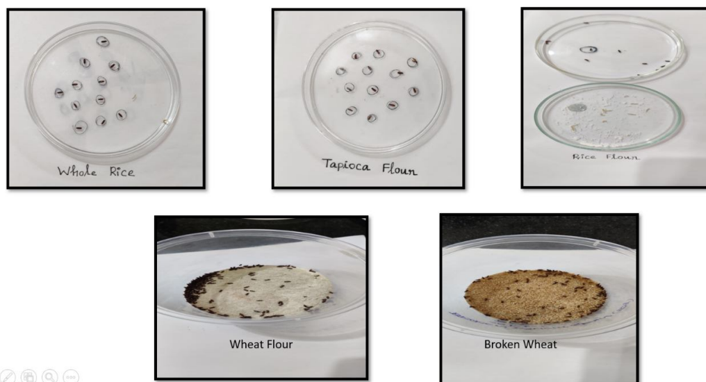
Fig 2. Red flour beetle in different hosts